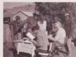
Census collection, Ernabella Mission, 31 June 1966