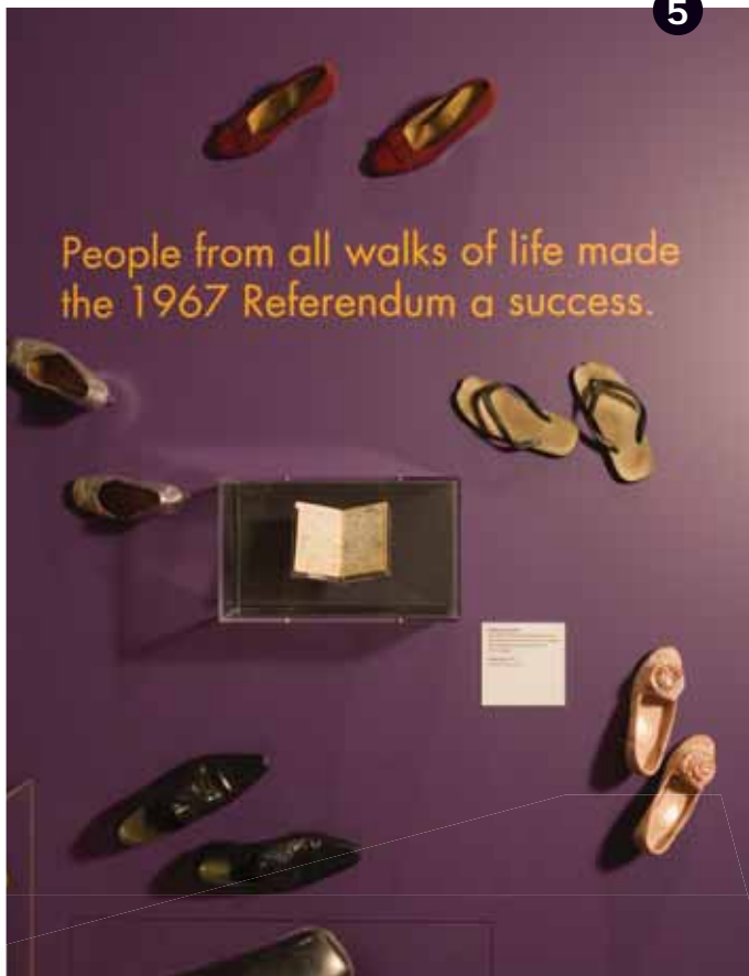
Shoes about 1960s