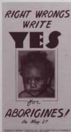
Referendum campaign pamphlet 1967

While the Australian Government supported the proposed change, the 'Yes' campaign was run by a key national lobby group, the Federal Council for the Advancement of Aborigines and Torres Strait Islanders. A remarkable mix of people — unionists, conservatives, Christians, communists, rich and poor, black and white — all worked together for change.