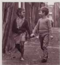
Racial discrimination, what's that? 23 May 1967 The campaign for the 1967 Referendum was widely covered in the media. Two days before the referendum, the Sydney Morning Herald included this original photograph on its front cover.

But Aboriginal people have had mixed responses to the referendum.