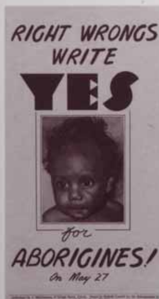
Referendum campaign pamphlet 1967

While the Australian Government supported the proposed change, the 'Yes' campaign was run by a key national lobby group, the Federal Council for the Advancement of Aborigines and Torres Strait Islanders. A remarkable mix of people — unionists, conservatives, Christians, communists, rich and poor, black and white — all worked together for change.