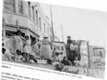
1967: A group of Indigenous people campaigning in Australia for a YES vote.

In 1967, after ten years of campaigning, a referendum was held to change the Australian constitution. Two negative references to Aboriginal Australians were removed, giving the recognition of Aboriginal people as full Australian citizens.