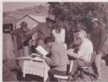
Census collection, Ernabella Mission 30 June 1966

Counted in the census? Yes and no. Aboriginal people had been counted in the census, but the figures were subtracted from the total.