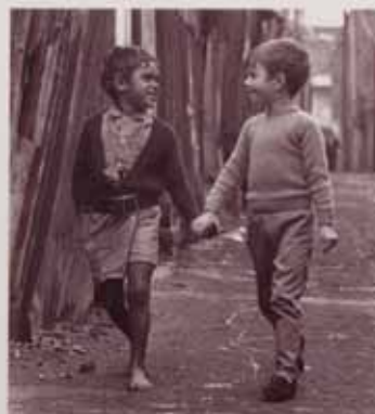
Racial discrimination, what's that? 23 May 1967 The campaign for the 1967 Referendum was widely covered in the media. Two days before the referendum, the Sydney Morning Herald included this staged photograph on its front cover.

But Aboriginal people have had mixed responses to the referendum.